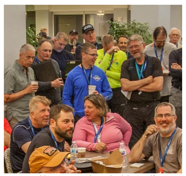
Did he just say what I think he said? Well, that may not have been said either, but pretty sure it sums up what most in the room were thinking at the time.

No, none of that was said...just a few groans and silence as the news was slowly absorbed through the 4:00 a.m. fog of tired brains which were suffering from not enough time for the coffee to have kicked in.