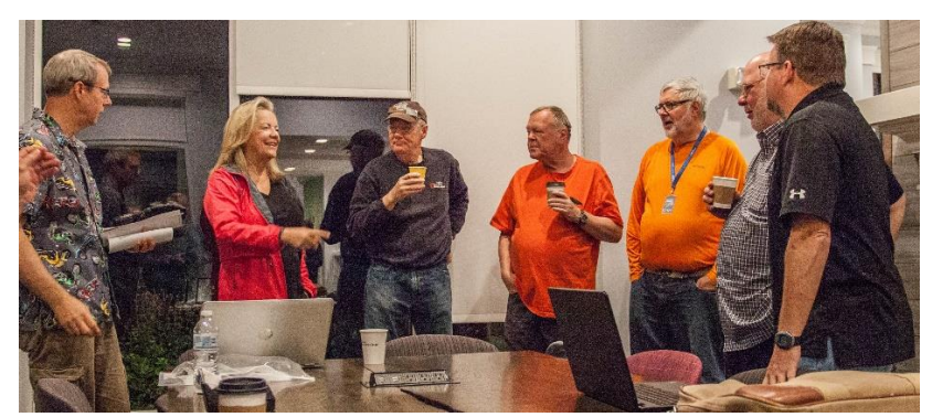
"Did you see their faces?"

Note the term "Checkpoint" is now being used in the report without the 1 or 2 designation. There is no Checkpoint 2 with the typical check-in, scoring, rest time, and handout of new rally packs. Checkpoint 2 is now just something to be collected as a bonus and must be claimed on the bonus form. Riders have the option to claim the Kennewick bonus, or drop the bonus and collect others, including many combination opportunities.