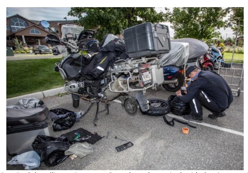
Dan Roth handling a tire swap. Gotta love those single sided swing arms!