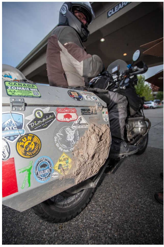
Wolfe Bonham hauling some terra-not-so-firma.