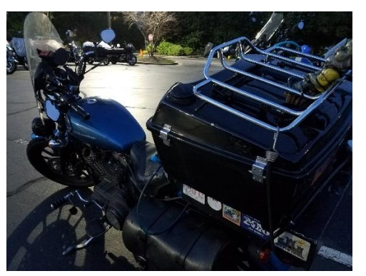
Is the camera angle making the trunk look larger than it really is? Maybe, but it is still a massive box!