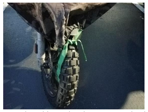
A seasoned world traveler chose to run a knobby on the front.