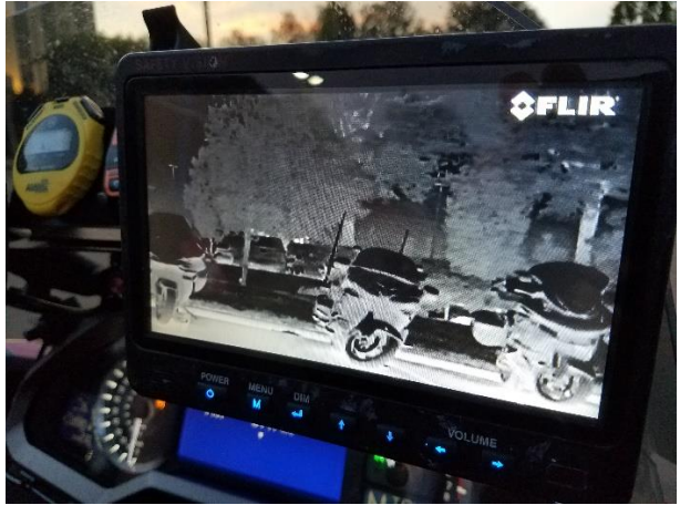
Bill Cumbie's FLIR infra-red camera and a view of the screen, helps a lot when riding in fog.