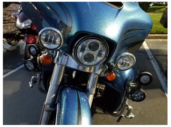
Two Harleys capable of producing a close approximation of daylight.