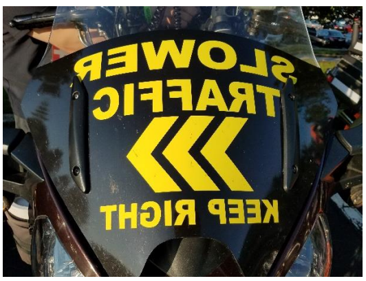
Move it on over!