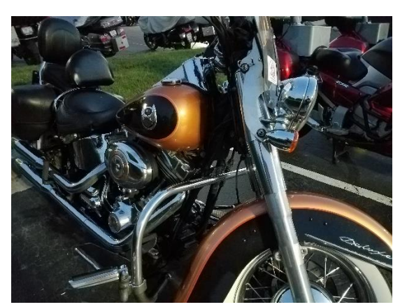
Two of the least farkled, minimalist bikes in the rally and they are both orange V-twins.